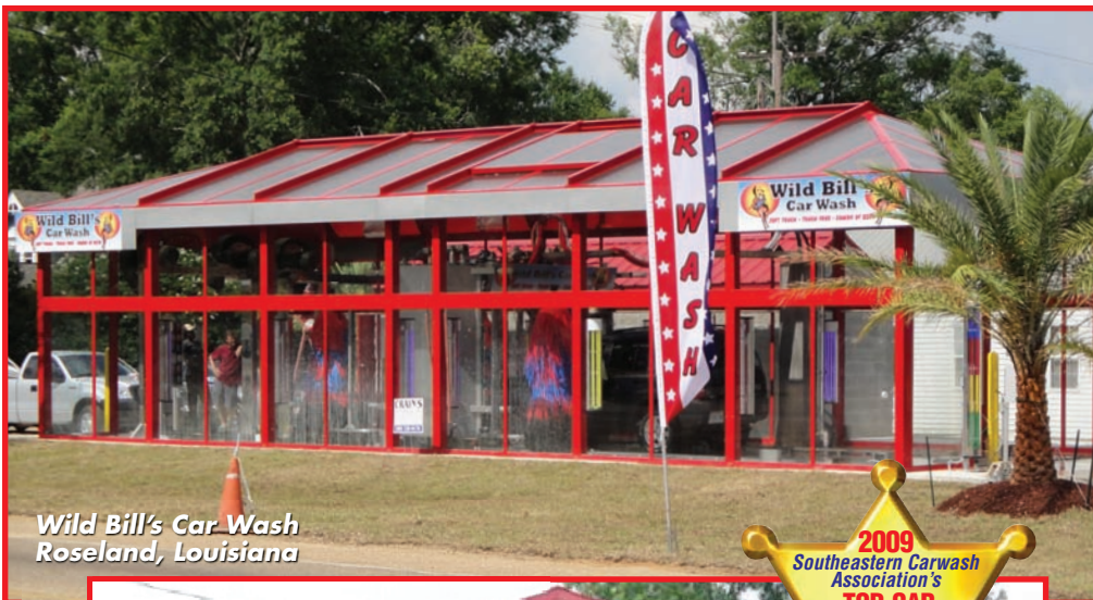
Wild Bill's Car Wash Roseland, Louisiana