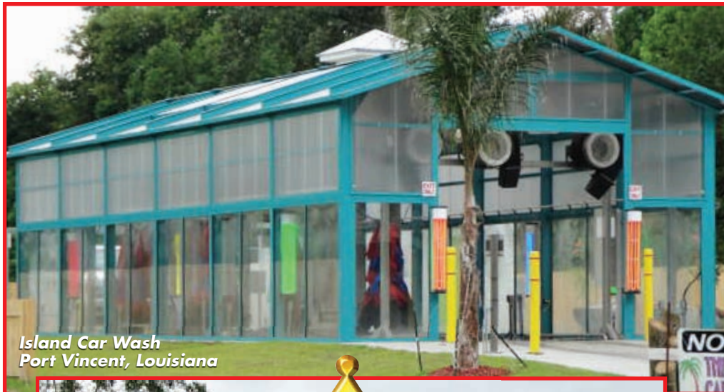
Island Car Wash Port Vincent, Louisiana