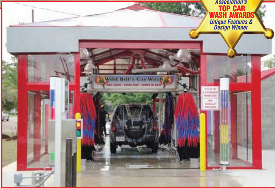
Wild Bill's Car Wash in Roseland, LA is yet another Louisiana car wash facility showcasing AUTEC's EV-1 Car Wash System...washing a documented 30-plus vehicles per hour.

Tangipahoa Parish now lays claim to housing the most modern, state-of-the-art car wash facility in Roseland, Louisiana offering the 'WILDEST' clean in the entire state! WILD BILL'S CAR WASH by Bozeman Distributors features the eye-catching AUTEC design glass structure and showcases AUTEC's EV-1 Evolution car wash system. This impressive system washes a documented 30-plus cars per hour.