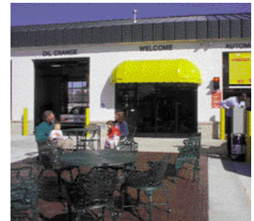
"Safe Area" For Customers To Relax While Waiting

"We decided early on that we wanted a quick lube/car wash combination," said Dewey Hammond. "We researched car wash systems for months before deciding to purchase our AUTEC . We toured manufacturing facilities, interviewed distributors, visited installations and discussed car wash performance with operators of all types of car wash systems. Our determination was that the AUTEC Soft Cloth system is more reliable, more profitable, cleans more thoroughly, and is better constructed than other systems on the market. The people at AUTEC still have a grasp on the concept of 'a personal touch.' Just a week or two after our opening, AUTEC's president called to see how things were going and to see if he could do anything for us. You just don't see that in a lot of companies today. That's the big picture of what AUTEC does for Fountain Plaza, but the bottom line is . . . They keep our customers coming back!"