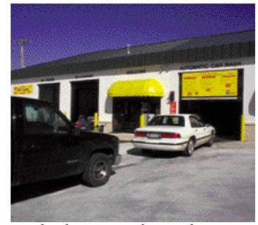
Quick Lube & Car Wash Bays Always Busy

"No lube center should be without an AUTEC Soft Cloth Car Wash . You only change your oil every three thousand miles, but you can wash your car at least once a week," commented Miriam Hammond, of Fountain Plaza Quik Lube and Car Wash Center in LaFayette, Georgia. "Just think of the revenue operators are forfeiting when they rely totally on a quick lube for their income."