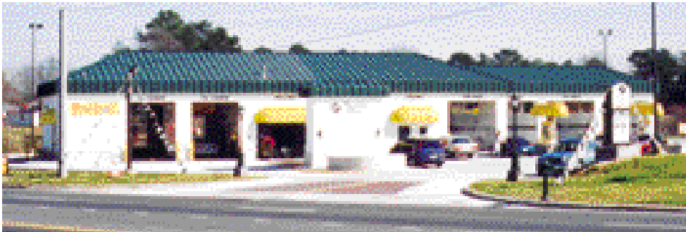
2 Quick Lube Bays, 1 AUTEC Soft Cloth Automatic, & 4 Self Service Wash Bays

A Classic Combination of Quick Lube, Car Wash & People Who Care